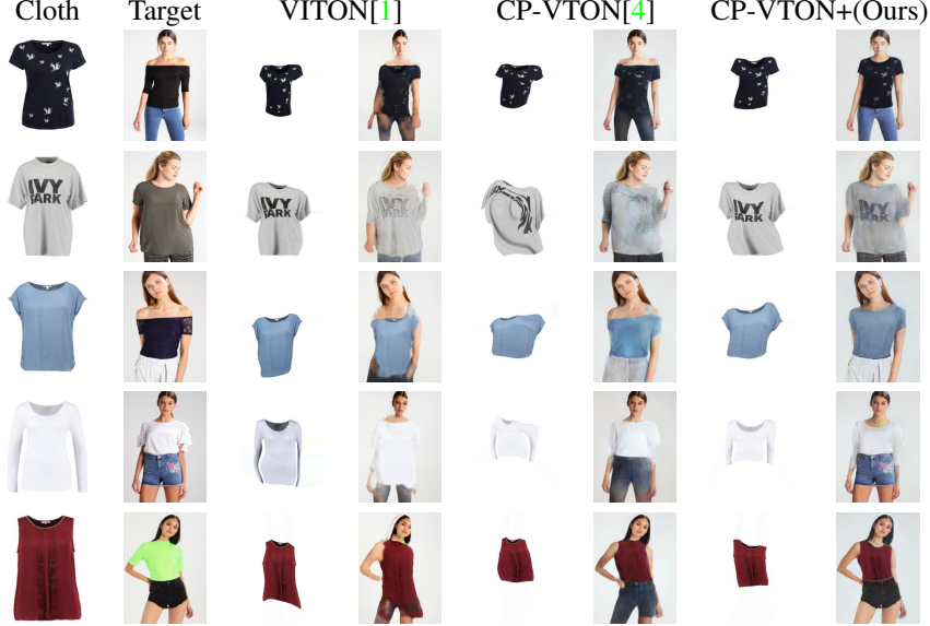
Figure 1. Qualitative evaluation of image-based VTOns (new clothing try-on): left to right, input pairs, VITON results, CP-VTON results, CP-VTON+ (ours) results). We present examples of different type of clothes here: from sleeveless to short, half and long sleeve, with different human body shapes/poses. Our method correctly preserves original clothing shapes, textures, and target human reserved regions.

beled as background and the body shape is often distorted by hair occlusion. We correct this as follows: A new label ‘skin’ is added to the label set, and then the label of the corresponding area is restored from the wrong label, ‘background’, considering the original human image and joint locations. The skin-labeled area is now included in the silhouette in the human representation. To recover the hair occlusion over the body, first the hair occlusion areas are identified as the intersection of the convex contour of the upper clothing and the hair-labeled area, and the intersections are re-labeled as upper cloth.